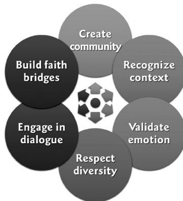
Figure 2. Reaching the secular person

How should we function as Christian educators? How should we live? The aspect of action focuses on reaching out with intentionality to secular postmodern persons with salvation purpose - “In the highest sense the work of education and the work of redemption are one.” (White, 1903.p. 30)-. It involves a number of key behaviors (see Figure 2).